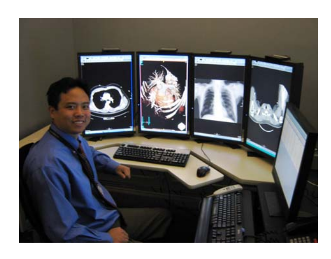
FlexScan MX240W is Penn Health's monitor of choice.

ately saw the importance of having such an innovative remote calibration available for our future applications in teleradiology."